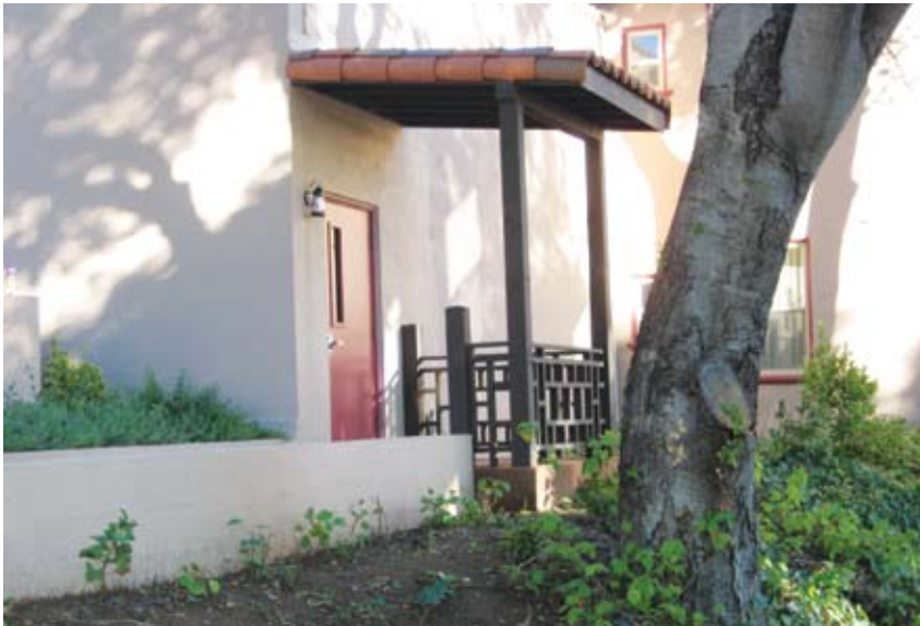
The new, accessible entrance to O'Mara Hall