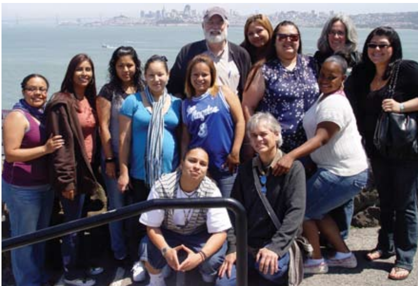
Our first Homegirl retreat group, enjoying a tourist moment.